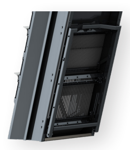
CLOSED POSITION finest screening

Better capture and additional safety factor offers peace of mind in design and across the broadest range of conditions