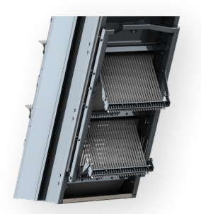
OPEN POSITION increased hydraulic capacity