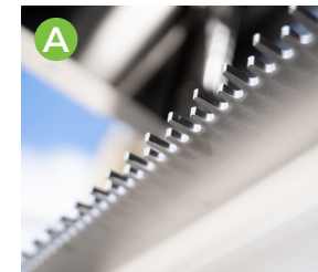
Re-engineered scraper provides up to 4x debris removal capacity and increased strength