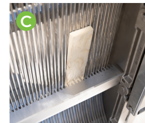
Rapid re-engagement removes large debris without shutdown to return scraper into the bar screen faster