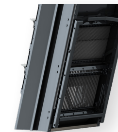
CLOSED POSITION finest screening

Better capture and additional safety factor offers peace of mind in design and across the broadest range of conditions