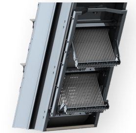
OPEN POSITION increased hydraulic capacity