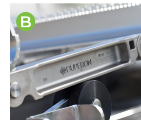
Patent-pending re-engineered FlexLink™ is designed for additional speed and long product life