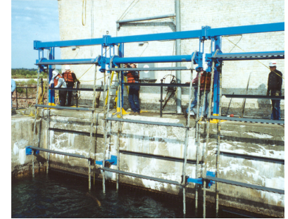
I-Beam mounting for Rake Only model