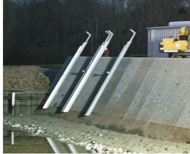
Side fab mounting for Rake Only model

Engineered to fit your existing bar rack and the unique needs of your site